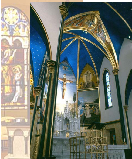
View of Sanctuary