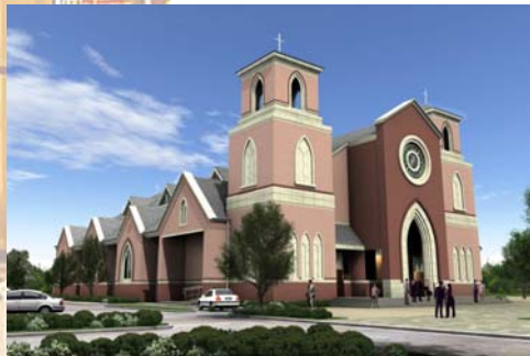
St Paul Exterior Perspective