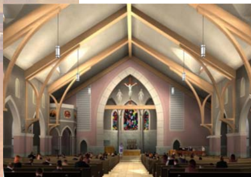
St Paul Interior Perspective

The design has evolved into a beautiful and creative synthesis of both traditional Catholic and local Floridian considerations. The underlying Gothic style was chosen for the historical association of the French Catholic presence in western Florida. However, the church is not intended to be an exercise in historicism. Rather, contemporary materials and structural systems create a lighter and more modern feeling to the nave.